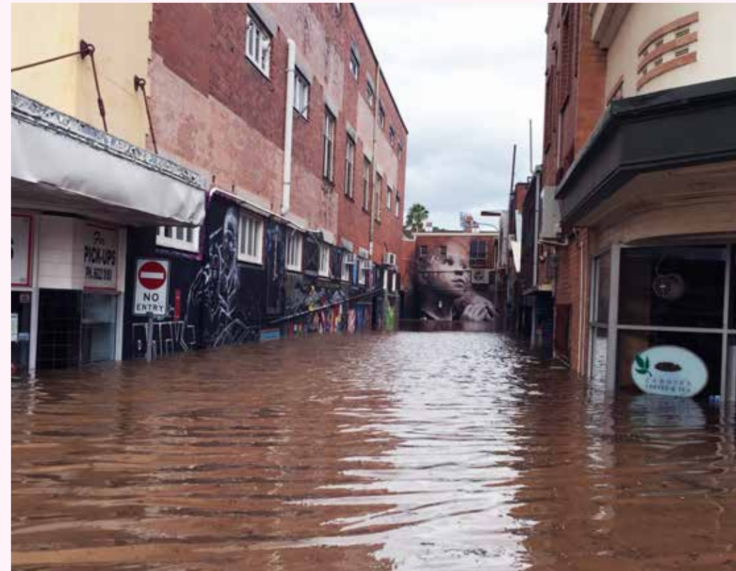
Lismore Flood

Posts from the Big Flood was a community art project commemorating and celebrating local stories with a community art exhibition. ANR partnered with MAT to deliver this project that was supported by a RANSW QUICK Response Grant applied for by ANR on behalf of the MAT project.